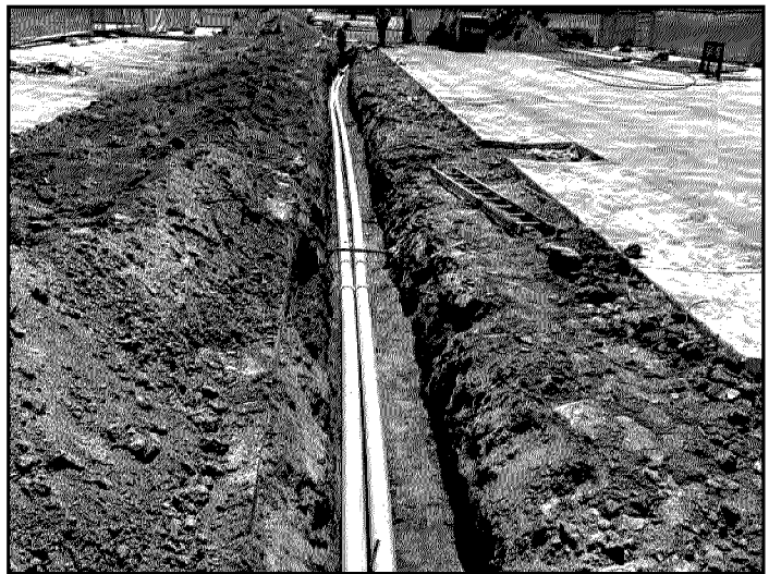
Electrical Trenching ADA Parking Lot