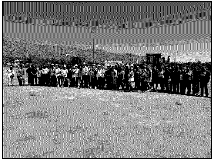
Groudbreaking Ceremony, Group Photo